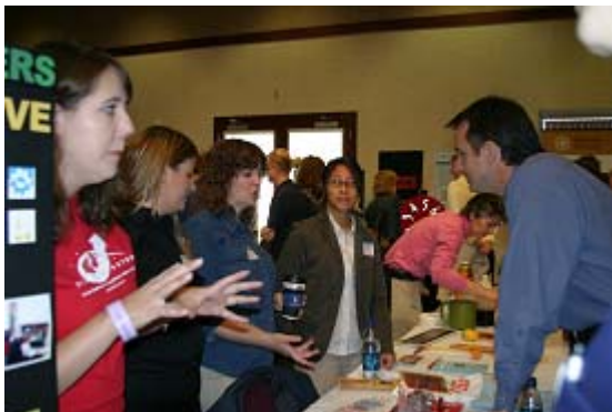
SWE-MN volunteers talking to the Governor at the STEM Summit 9/30/06

The number of participants reached over 800 students in addition to the 200 exhibitors and volunteers!! Discovery Hall was a very busy place and SWE-MN was happy to discuss the SWE scholarships and other engineering questions with the high school students in attendance.