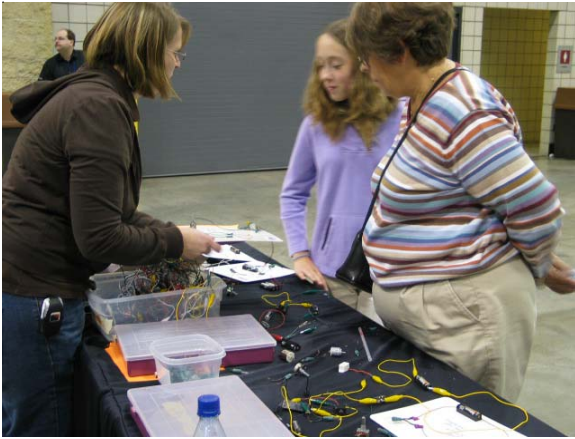
Circuits at the "Fox 9 Girls & Science 10/07/06"