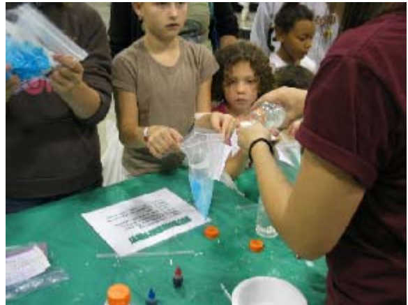
Slime at the “Fox 9 Girls & Science” 10/07/06

Career Guidance kicked off October with the 2006 Fox 9 “Girls & Science” at the Saint Paul River Centre on October 7 th . The target age for the Girls & Science event was 4th-8th grade girls. The event was a huge success and the SWE-MN was the HIT of the event!