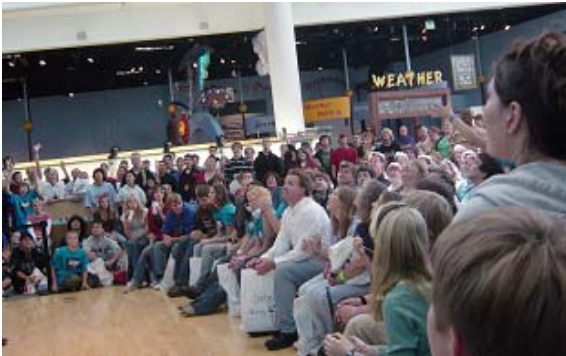
Students at the Governor’s “Open Talk” at the STEM Summit 9/30/06

Saturday, September 30th at the Science Museum of Minnesota, SWE-MN displayed a booth full of volunteers to talk about engineering! The event kicked off with the Governor’s speech; giving a successful launch for the statewide initiative promoting advanced Science, Technology, Engineering and Math (STEM) coursework to Minnesota high school students.